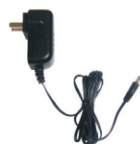
KTC-260 Switching power

The standard accessories supplied for the radio have a variety of specification options adaptable to different countries and regions.