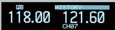
Operating information is clearly shown on the OLED display.

A fixed mount VHF airband first! The IC-A210 has an organic light emitting diode (OLED) display. The OLED display emits light by itself and the display offers many advantages in brightness, vividness, high contrast, wide viewing angle and response time compared to a conventional display. In addition, the auto dimmer function adjusts the display for optimum brightness at day or night.